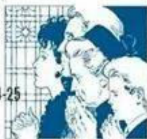
Evangelical Bible Church

"God is a Spirit: and they that worship him must worship him in spirit and in truth." John 4:24