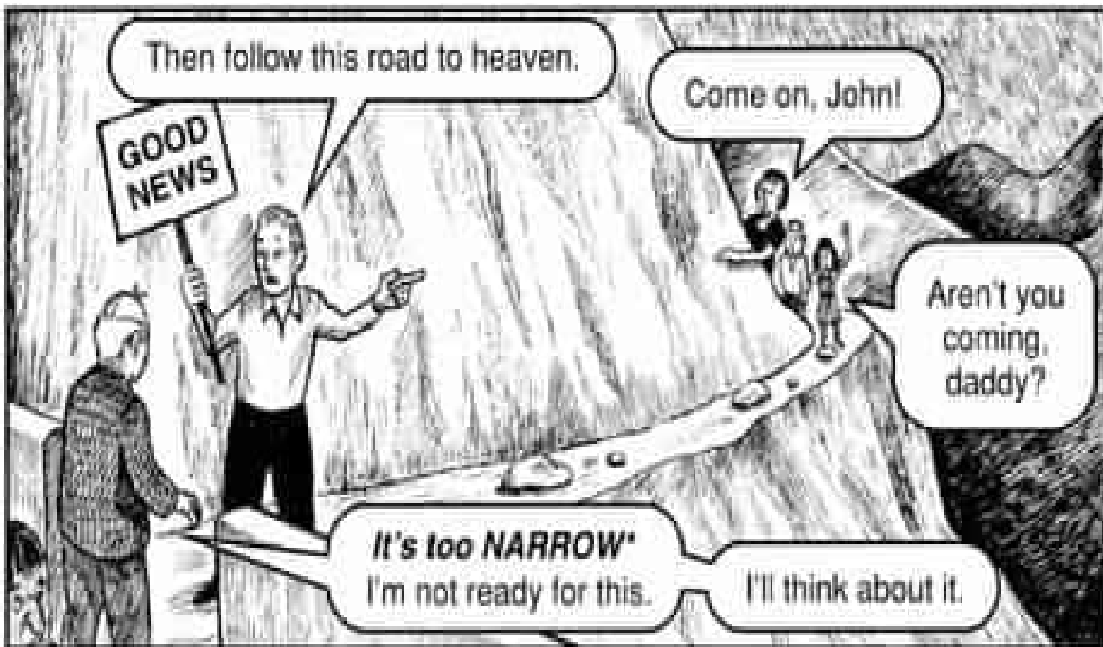
"...narrow is the way, which leadeth unto life, and few there be that find it." Matt. 7:14