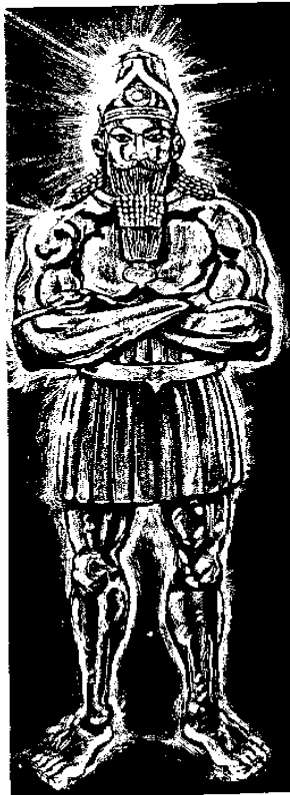
The Vision Daniel 2:31-33

"These great beasts, which are four, are four kings, which shall arise out of the earth. But the saints of the most High shall take the kingdom, and possess the kingdom for ever, even for ever and ever. (Daniel 7:17-18).